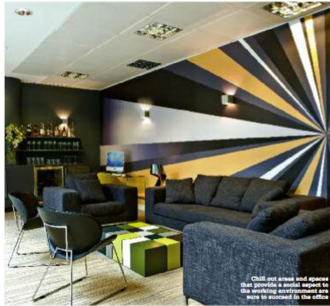
Chill out areas and spaces that provide a social aspect to the working environment are sure to succeed in the office

they have three offices and we at Callender Howorth have been working with them for the past 12 years so we understand their wants and requirements and are able to work flexibly around the company because we have seen them grow and understand their ethos. Understanding what is required of the space is crucial - do they entertain other clients? Hot desk? Is it open plan? Are boardrooms central to the companies working style? All of these things need to be considered and noted in the brief at the start of the process. From