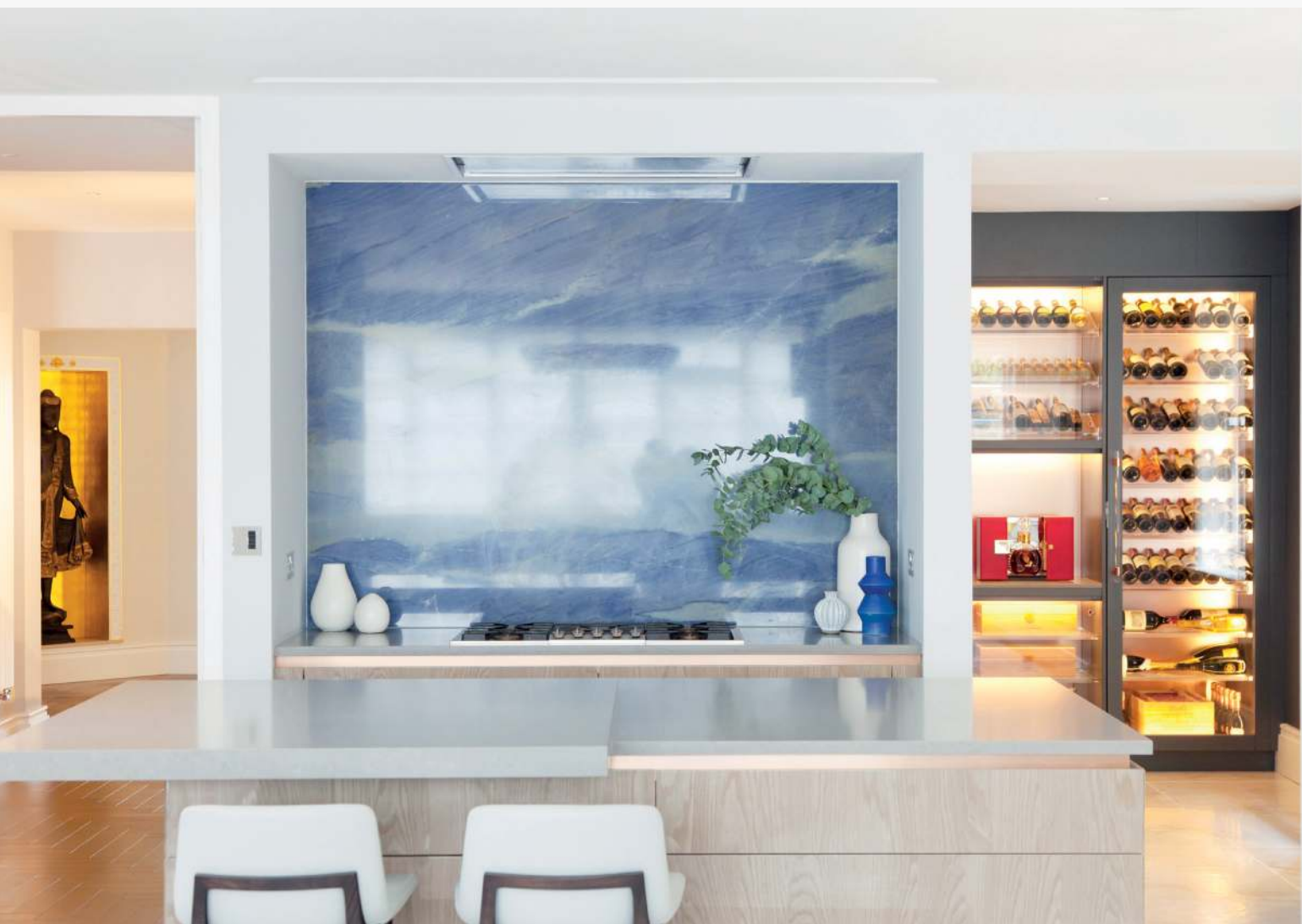
ROCK STAR Above: The Guptas' kitchen with the blue marble from Brazil and the Cellar Maison wine wall; the Buddha from Burma can be seen in the hall