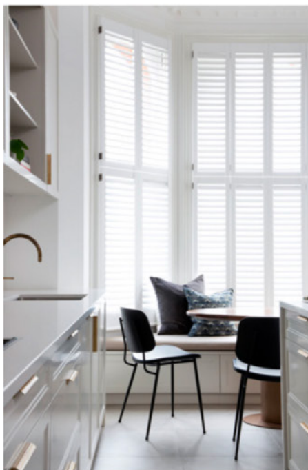
BREAKFAST AREA ‘Positioned to overlook the pretty street outside, this nook is the perfect spot for people-watching over breakfast,’ says Mark. Beetle dining chairs, Gubi. Pedestal dining table, Liang & Eimil. Shutters, Downers Design